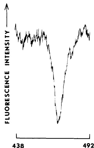
Figure 1. Fluorescence-detected zero field EPR transition in R. rubrum cell suspensions at 2 K. Excitation of fluorescence is at 590 nm with dye laser, and detection wavelength for optical-microwave double resonance experiment is 920 nm. Frequency scale is in megahertz.

We have studied triplet state species of the photosynthetic bacterium Rhodospirillum rubrum in chemically reduced preparations 6 by zero-field optical detection of magnetic resonance at 2 K. An approximately 3 \times 10^{-2} M solution of sodium dithionite in 50% (by volume) glycerol and 0.1 M Tris-Cl - buffer, pH 7.4 (deoxygenated with nitrogen), was used to volume dilute packed whole cells of R. rubrum 7 by approximately six times forming a stock solution of dithionite treated whole cells. In practice a further dilution without dithionite of this stock solution by a factor 50 appeared to provide the best samples for optical detection